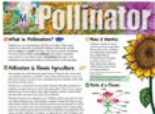
Pollinator Ag Mag